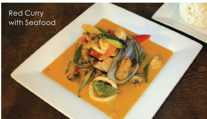
Red Curry with Seafood