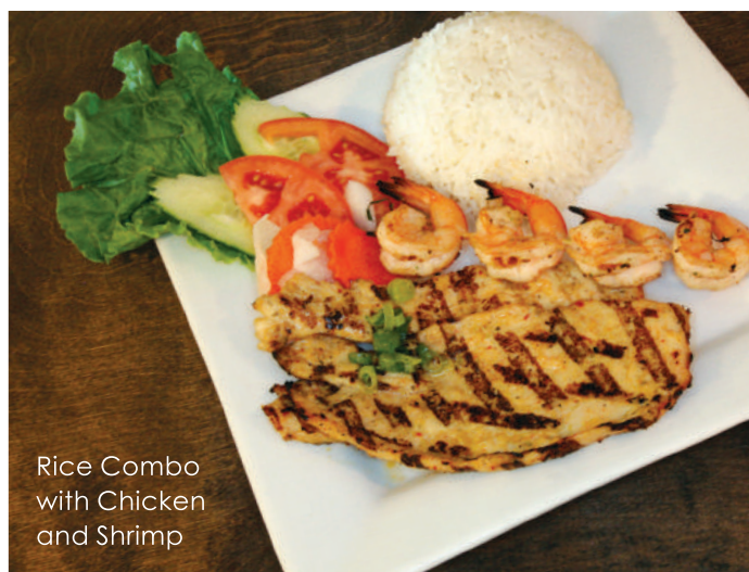
Rice Combo with Chicken and Shrimp

PLEASE NOTIFY YOUR SERVER OF ANY ALLERGIES